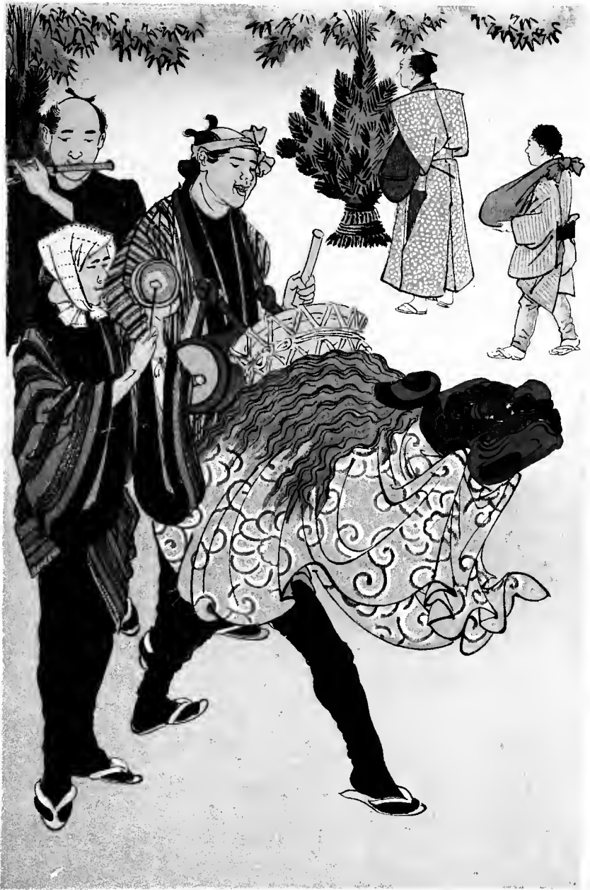
Lion-Dance on New Year's Day